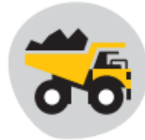
MINING & RESOURCES